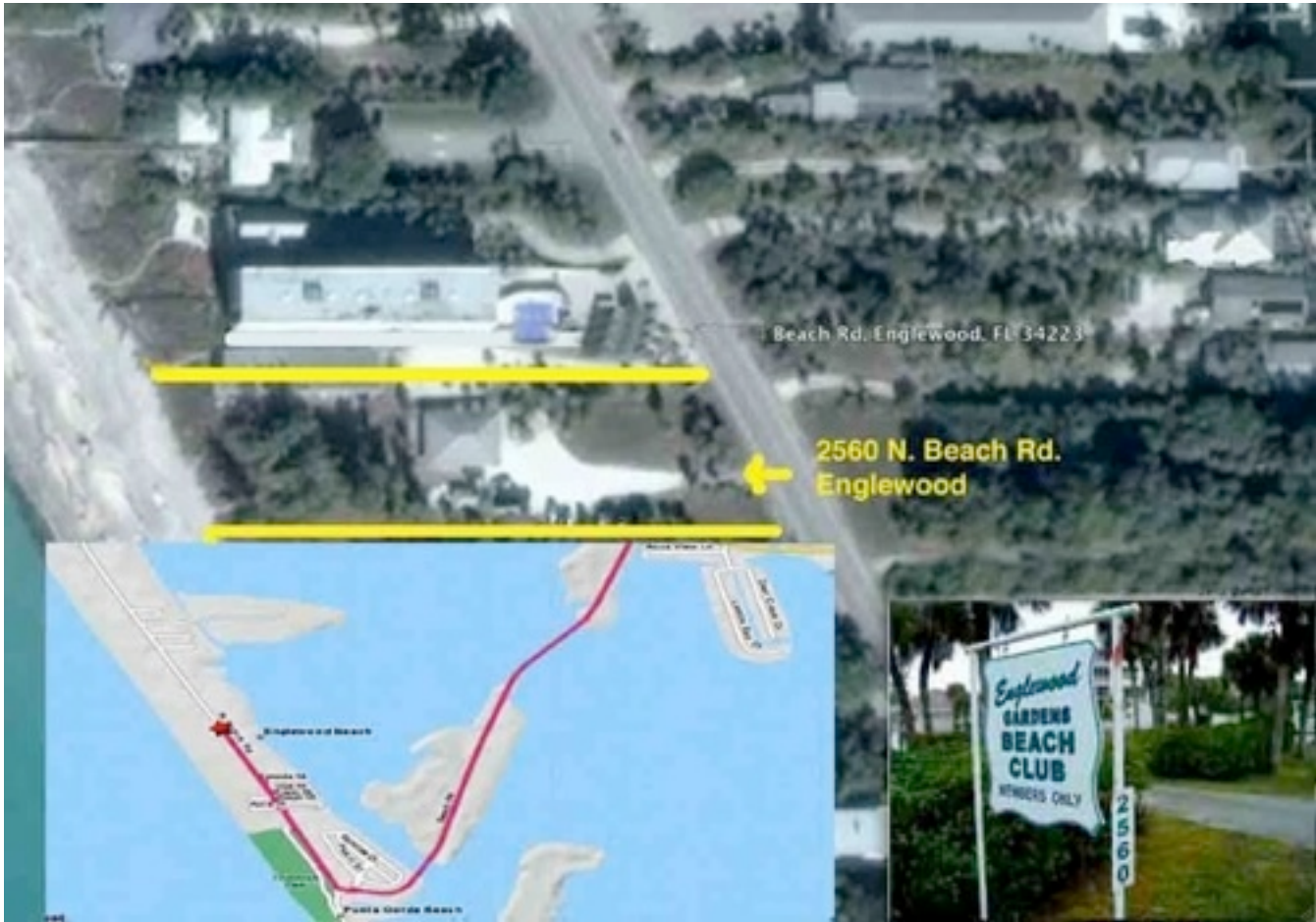
Pizza Social Location